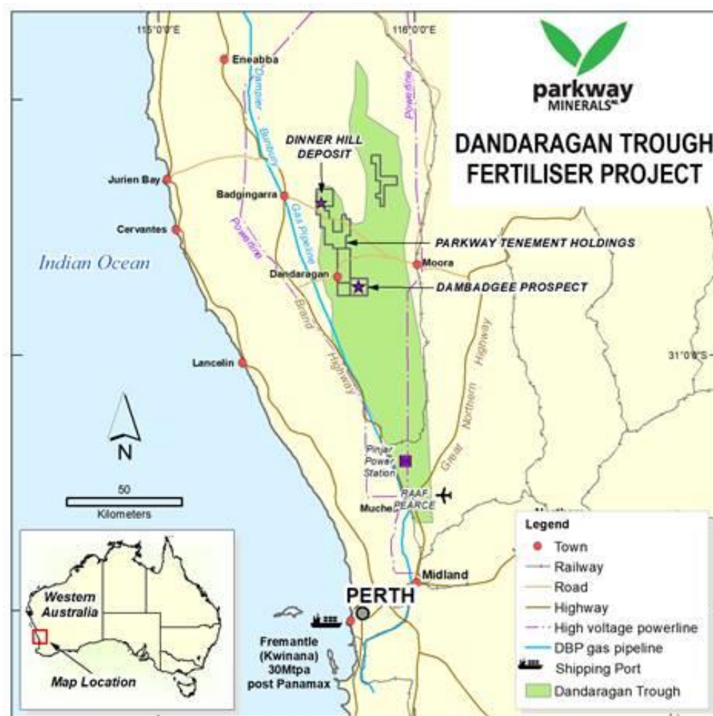
Figure 1 Dandaragan Trough Project location

Parkway had previously released an Exploration Target for the Prospect based on historical drilling and on limited drilling completed by Parkway (refer ASX release 28 September 2017 "New Exploration Targets for Dandaragan Trough").