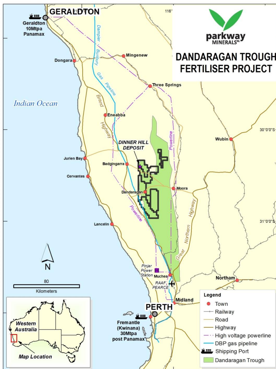
Figure 1: Location Plan, Dandaragan Trough Fertiliser Project

The project tenements cover two virtually horizontal greensand formations within the Cretaceous Coolyena Group: the Poison Hill Greensand and the Molecap Greensand. Over most of the area of the deposit they are separated by the Gingin Chalk and in places are underlain by a thin pebble horizon containing phosphatic nodules. An average thickness of about 11m of surficial, mostly sandy, cover overlies the greensand units. The greensands and the chalk contain significant amounts of phosphate as grains and nodules of fluorapatite. They also contain significant potash within the mineral glauconite. Figure 2 is a cross section through the deposit showing the geology and summary intersections through potash and phosphate mineralization.