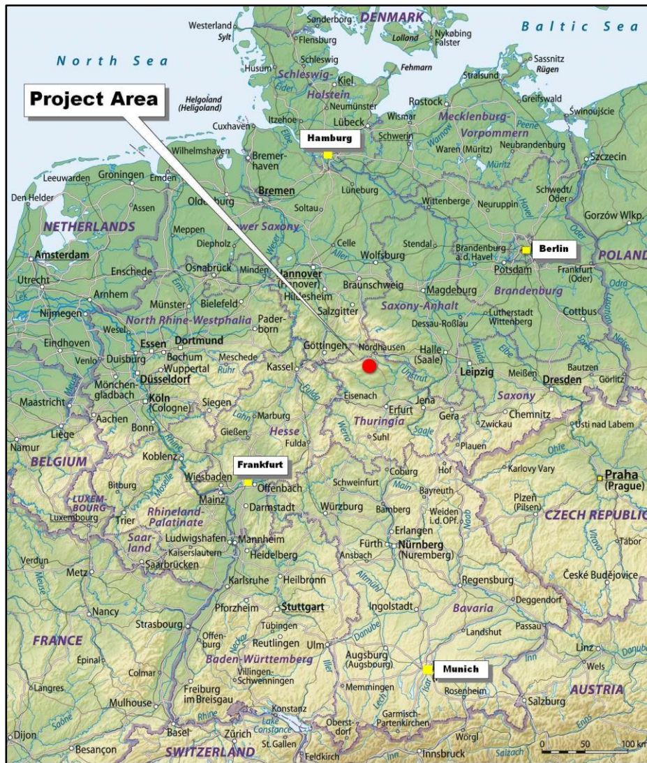
Figure 1 EEG Project location

Potash West NL is earning 55% of East Exploration Pty Ltd, by funding applications and exploration on licences, Kuellstedt and Graefentonna, in the South Harz region of Thuringia, Central Germany (see Figure 1). The project has unique advantages in excellent connectivity to transport facilities, infrastructure and proximity to local markets.